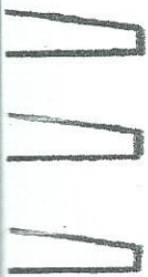
Schnitt G - G